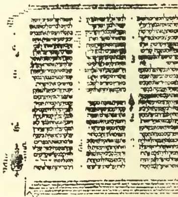
Reduced fac-simile of MS. in the possession of the Earl of Leicester. (Ex. xxix. 36—xxx. 11.)

Their one design is to secure the correct transmission of the Hebrew text, so that not a word or a letter may be misplaced, omitted, or inserted.